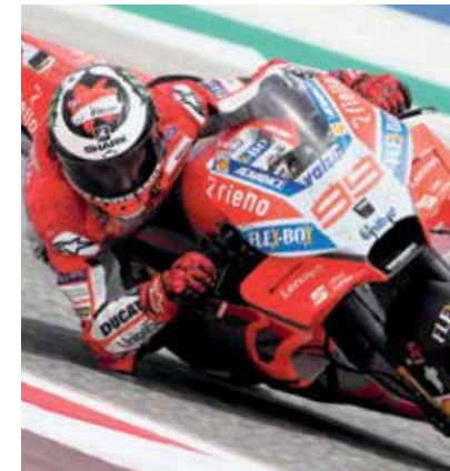
If Lorenzo keeps struggling in MotoGP, we could see him racing in British Superbikes

Six world championships already and he's got loads of time yet. But that move to another manufacturer will have to come eventually. Nobody likes the same person winning every year on the same bike.