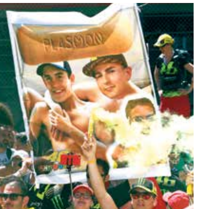
Both Marquez and Lorenzo have suffered abuse, often from Valentino fans

and tell people to do whatever he wanted. He's like a god and they'll do anything for him. I do sometimes think the booing might drive Marquez. He might be thinking 'y eah, you boe me you b*****ds and then watch me annihilate him on track'. The lad's on another level, he crashes and just gets away with it. He pushes the envelope each and every time. I'll tell you what, he scares me when I see him on a motocross bike. The crowd hostility won't bother him, but it does need to stop. All the riders in MotoGP and beyond deserve our full respect.