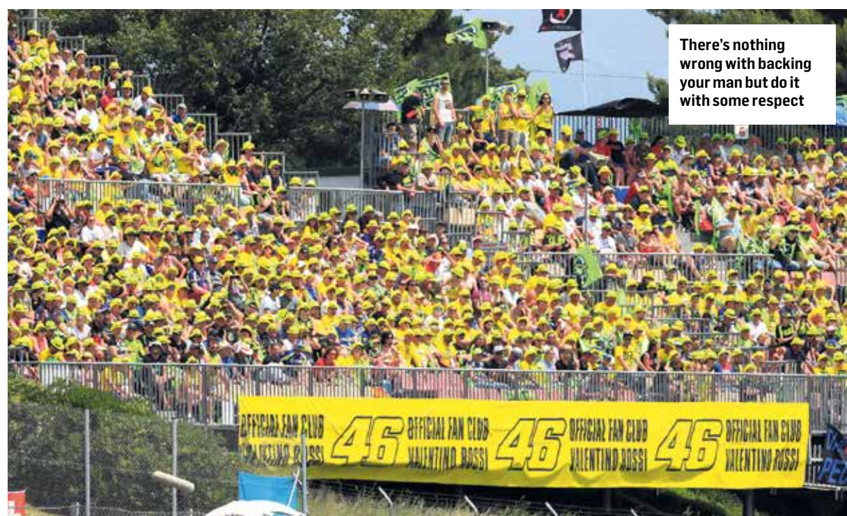
There's nothing wrong with backing your man but do it with some respect

people need to wake up. The hatred for Marquez is interesting. I mean, nobody likes to instruct an agent law firm every week because it gets a bit boring. Nobody liked it when Mick Doohan was winning all the time back in the 1990s, or when it was Lawson or Rainey or whatever. It's all because Rossi has such a big and loyal following isn't it? I don't know what they're going to do when he hangs up his boots. There's an army of yellow everywhere you go. I often wonder what the other Italian riders think of it. Rossi is like the Messiah. He could have a cult of people following him