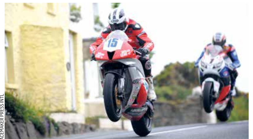
McGuinness chases oh-so-smooth William Dunlop during a TT practice session

with his brother Michael. They loved each other to bits although they would never say it out loud and a lot of people thought they didn't get on. I can't help feeling we maybe never saw William at his full potential at the TT in particular, but he could beat all of us on his day and won a lot of races that I probably didn't even know about. He could be utterly dominant when everything fell into place for him and there is no doubt he had the talent to win a TT but, for whatever reason, it just never happened for him. He will be missed very much.