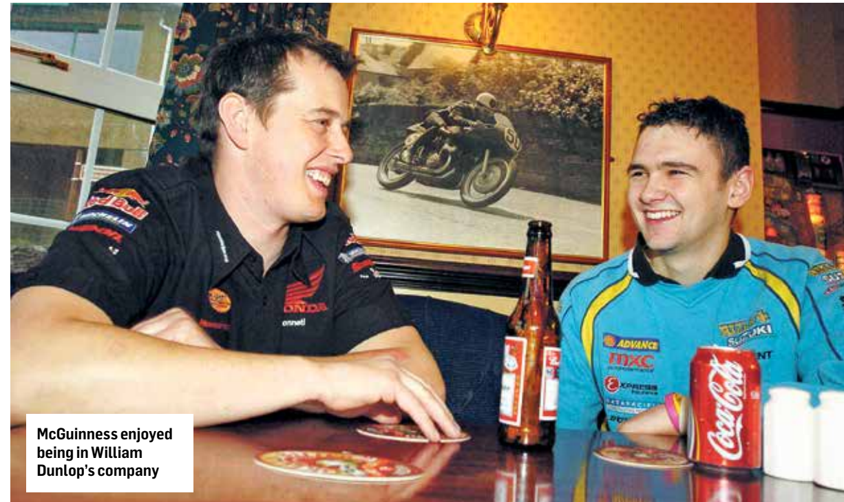
McGuinness enjoyed being in William Dunlop's company

I have raced against most of the Dunlops, both the first and second generations of the dynasty, including William. He was always a very fair rider and you could ride wheel-to-wheel with him all day long without any worries. He was very stylish and really leaned the old girl over. Away from the track William was a bit like Joey. He was a quiet fellow with a very dry sense of humour and any time I was in his company I always enjoyed it. It was interesting to see him