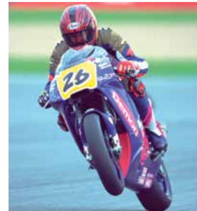
The two-stroke Honda used to get loaded into a van and raced all over the country

To be honest I'm always on the lookout for new bikes to add to my collection. A lot of my friends will buy a £100 shirt, or a watch or whatever but I'd rather channel the money into buying a motorcycle. I prefer that over looking good.