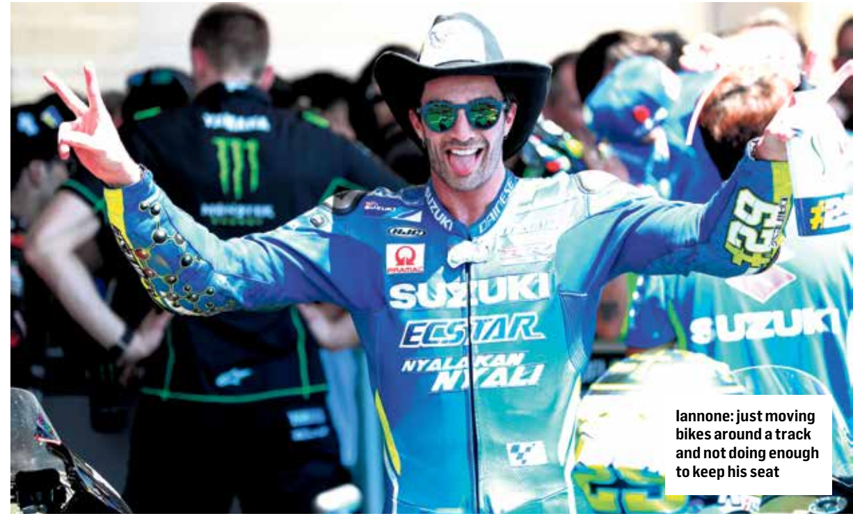
Iannone: just moving bikes around a track and not doing enough to keep his seat

Do you know what I don't get? I follow that Andrea Iannone on Instagram and he's absolutely embarrassing. He thinks he's a Hollywood pin-up boy; what the hell is that about? Who is taking the pictures? Who is organising all of this, opening his leathers and getting him to stick his chest out? It's the worst image I've ever seen for motorbike racing. It's bizarre. What direction is he going in? MotoGP racers aren't pin-up