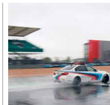
Heavy rain last year caused a disaster but Silverstone have taken the right action

I'm not saying it's boring, but take Paul Ricard in France for instance, if you run off track you just take a big sweeping line on concrete and re-join – it's not a real challenge. That makes everyone braver than they really are because you aren't going straight into the gravel trap. The new surface should give us some pretty amazing lap times though – especially on a MotoGP bike because of the speed the guys will be able to carry through the corners. I like to see lap records get broken, but I prefer to see close racing.