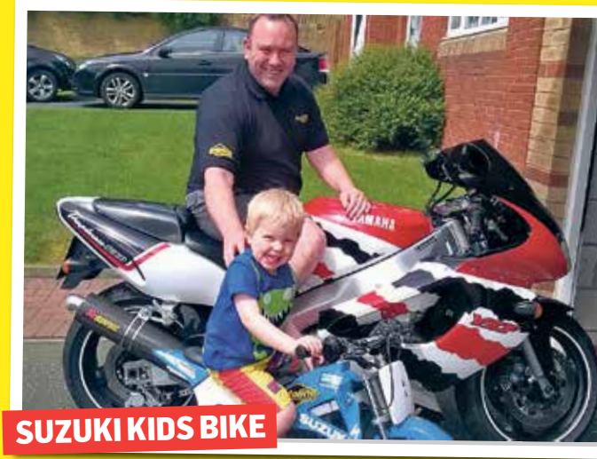
SUZUKI KIDS BIKE