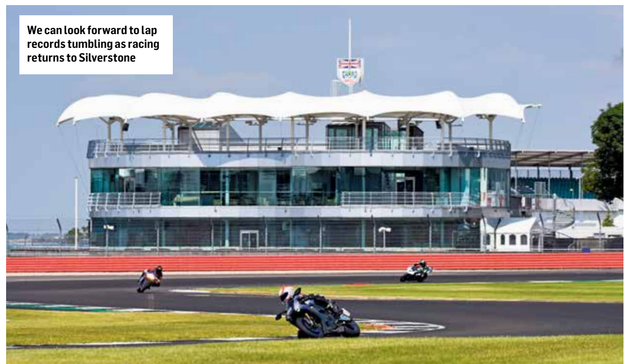
We can look forward to lap records tumbling as racing returns to Silverstone

We've seen some incredible races over the years, going back to Sheene and Roberts in 1979. I know they've done a lot of work to get rid of the bumps and while I understand the reason behind it and I'm sure the MotoGP guys are going to love it, I do actually like the odd bump! It's not just because I'm a road racer, but when you ride bumps on a track it gives you a buzz. You have to figure out how your bike is going to feel when you hit them. For me it's part of the challenge. So when a track is absolutely clinical and smooth, it is as a challenging?