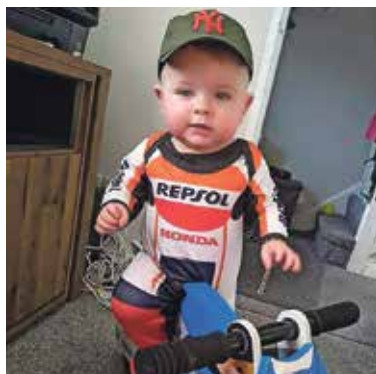
'Now, how do we get it fired-up?'

I have just read the two letters relating to E-bikes (MCN, January 12). In my opinion the use of fully